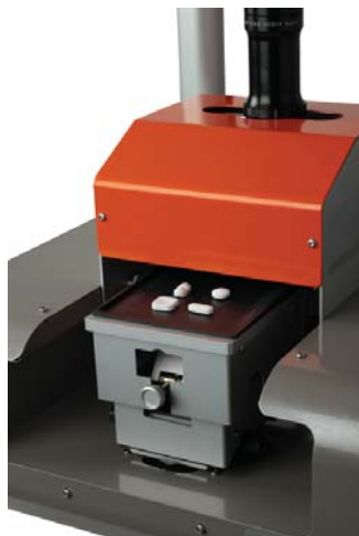
Picture 2. A sample tray holding cheese granules has been loaded into sisuCHEMA, here fitted with a macro lens, which images the samples at 30 micron resolution.