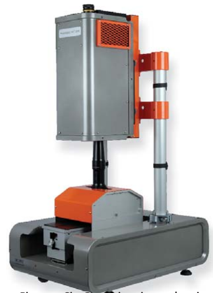
Picture 1. SisuCHEMA imaging workstation

SisuCHEMA comes with various sample trays that can be loaded into the instrument while containing dairy samples (picture 2). SisuCHEMA's push-broom technology along with all its advantages provides a rapid measuring procedure, a pre-requisite for keeping the often moist and fresh dairy samples unimpaired. The recorded hyperspectral images are then easily transferred to the analysis software Evinco, where chemical composition and its distribution can be analyzed and viewed with various types of visualizations (picture 3).